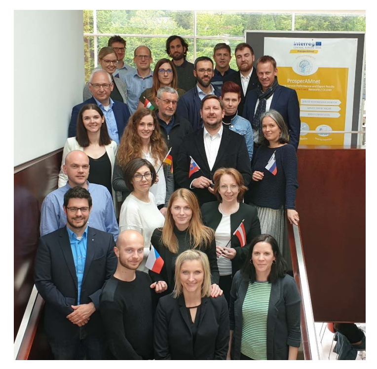
Group photo of the partnership at the ProsperAMnet kick-off meeting on 6-7 May 2019